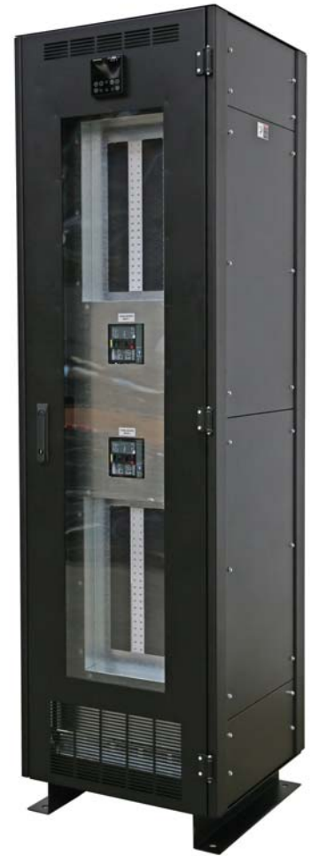
Optional polycarbonate viewing window shown